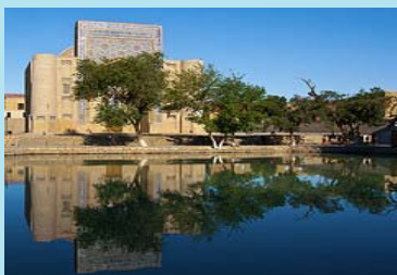
Just outside our Bukhara hotel