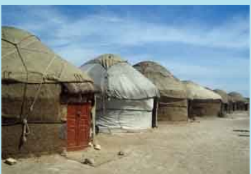
Nomadic yurt accommodation

Food and drink: Breakfast is included every day along with dinner at the yurt camp. Elsewhere, we enjoy the great variety of local food on offer. Beer, wine, vodka, soft drinks, tea, coffee and bottled water is all widely available.