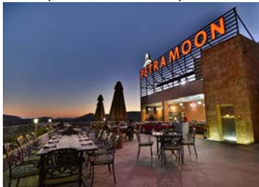
Comfort at the Gates of Petra