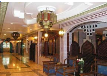
Eco Friendly 3+ Star, Amman

Food and drink: Breakfast is provided each day, along with 3 lunches and 1 dinner. Beer, wine & spirits are available at selected locations whilst soft drinks, juices and bottled water are available throughout.