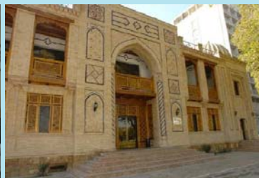
Traditional-style hotel in Samarkand