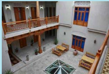
Courtyard hotel in Bukhara