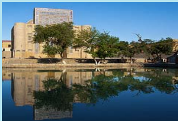
Just outside our Bukhara hotel