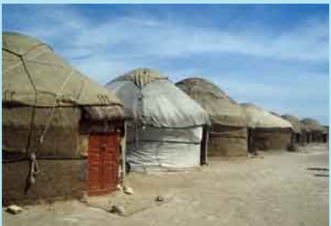
Nomadic yurt accommodation

Food and drink: Breakfast is included every day along with dinner at the yurt camp. Elsewhere, we enjoy the great variety of local food on offer. Beer, wine, vodka, soft drinks, tea, coffee and bottled water is all widely available.