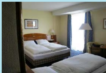
Comfortable 4* hotel in Tashkent

Accommodation: Contrary to popular opinion, Uzbek hotels are fine. Rooms can be quite small and 4* hotels might be considered closer to 3* by international travellers, but we've selected what we think are some of the best hotels in the country, in terms of character, service and location. In Tashkent we stay in a renovated Soviet-era style hotel. In Samarkand our traditional-style hotel is minutes from all the sights. In Bukhara our small, Uzbek-style hotel gets great reviews. In Khiva our hotel is by the gates of the old city and again among the best available – and the yurt experience is relatively comfortable and a great cultural experience.