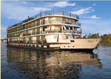
Luxury on the Nile