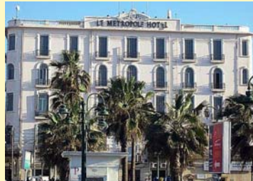
Comfort by the Mediterranean

Food and Drink: Breakfast is included every day and all meals are included while on cruise. Elsewhere, we enjoy the great variety of local food on offer. Soft drinks are widely available and alcohol can sometimes be hard to find .