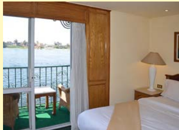
Double Cabin with Nile Views