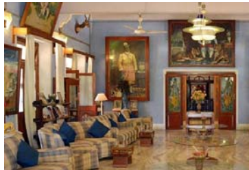
Former Maharaja's palace, Karauli