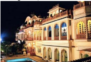
Heritage hotel, Jaipur

Food and drink: Breakfast is provided each day along with 4 lunches and 4 dinners. Beer, wine, spirits, soft drinks and 'lassi' are widely available.