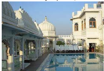
'Palace-style' with pool, Udaipur