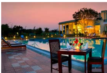
Wilderness luxury, Ranthambore