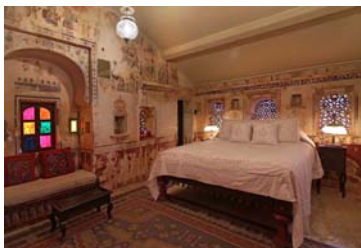
Heritage hotel, Narlai