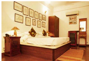
Boutique hotel, New Delhi

Accommodation: India offers an amazing abundance of fantastic and surprising accommodation, including lodges, palaces and havelis (old merchant homes). In Delhi we stay in a top-rating boutique hotel; in Karuli, Jaipur, Jodhpur and Narlai our classic hotels are heritage-listed, whereas in Ranthambore and Udaipur we stay in lovely 'palace-style' properties that will not disappoint. Agra is the only place where the majority of accommodation is a little 'ordinary' and here we've chosen a well-established property that suits our requirements nicely. Four of our hotels have swimming pools.