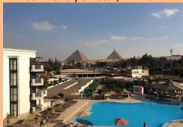
By the Pyramids in Cairo