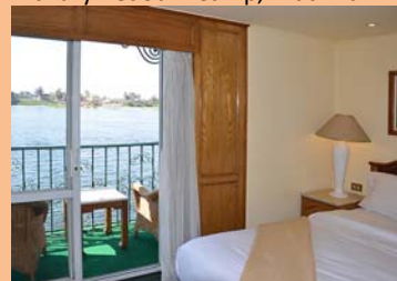
Nile Cruise with River Views