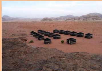
Luxury Bedouin Camp, Wadi Rum