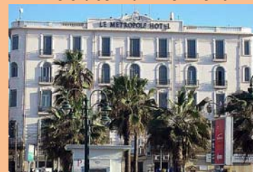
Comfort by the Mediterranean

Food and drink: Breakfast is provided daily and all meals while on Nile Cruise. Beer, wine & spirits are available at selected locations whilst soft drinks, juices and bottled water are available throughout.