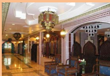
Eco Friendly 3+ Star, Amman

Accommodation: Hotels in Jordan and Egypt tend to be reasonably new and modern in their design with few boutique style hotels available. What you can be assured of is that they will be clean, comfortable, well located and well run. Accommodation highlights include a luxury Bedouin Camp in Wadi Rum and a 4 star hotel in Cairo close to the Giza Pyramids. Comfortable overnight 2 berth sleeper between Cairo and Luxor and roomy cabins with Nile views onboard a river cruiser. In Aswan we stay in a traditional style Nubian hotel and in Alexandria our colonial style hotel sits by the Mediterranean on Alexandria's famous corniche.