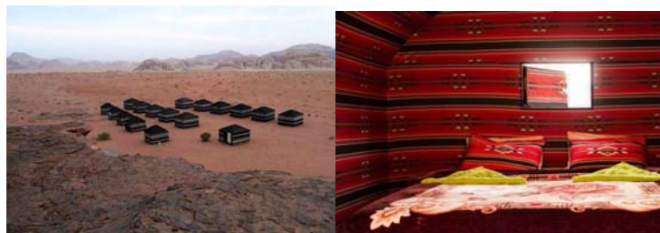
Atmospheric Bedouin Camp in the stunning desertscape of Wadi Rum