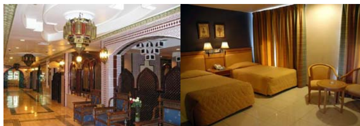
Eco Friendly 3+ Star, Amman

Accommodation: Hotels in Jordan tend to be quite new and modern in their design with few boutique style hotels available. What you can be assured of is that they will be clean, comfortable and well run. In Amman we stay in an atmospheric 3+ star hotel with an arabic feel while on the Red Sea at Aqaba our hotel is a modern classic style. Our comfortable Bedouin Camp in Wadi Rum is set amongst stunning desert scenery and is an unforgettable experience. During our stay in Petra our top rating hotel is located just 100m from the entrance to the Heritage site. It's renowned for its friendly staff and excellent service.