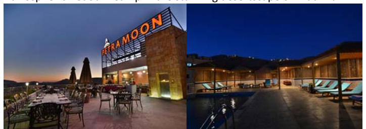
Comfort & Charm at the gates of ancient Petra

Food and drink: Breakfast is provided each day, along with 1 lunch and 1 dinner. Beer, wine & spirits are available at selected locations whilst soft drinks, juices and bottled water are available throughout.