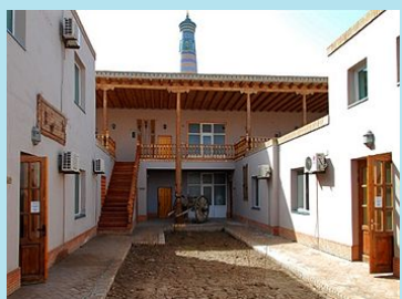
The best location in Khiva