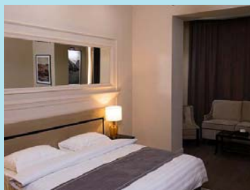
Modern 3* hotel in Bishkek

Accommodation: Contrary to popular opinion, Central Asian hotels are fine. Rooms can be a little small and 4* hotels might be considered closer to 3* by international travellers, but we've selected what we think are some of the best hotels in the country, in terms of their character, service and location.