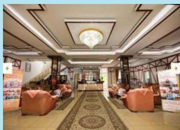
Comfort in the Ferghana Valley