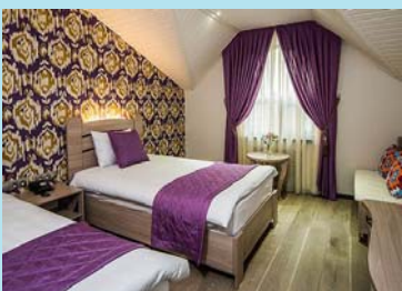
Stylish in Tashkent