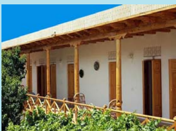
Courtyard Hotel in Bukhara

Food and drink: Breakfast is included each day. Elsewhere, we enjoy the great variety of local food on offer. Beer, wine, vodka, soft drinks, tea, coffee and bottled water is all widely available.