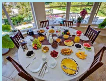
Breakfast in Karakol