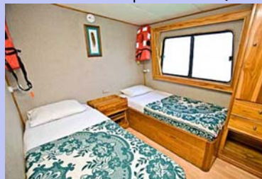
MY Fragata Twin - Upper Deck