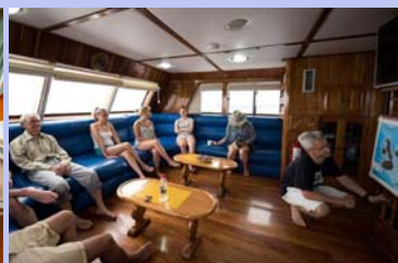
MY Fragata – Lounge Room