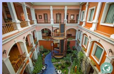
Court Yard Boutique Hotel in Quito

Accommodation: Your elegant boutique hotel at the start and end of your trip is located in the historical centre of Quito. On-board MY Fragata cabins are located on 2 decks and offer both twin and double beds, all with private en-suites (upper deck have larger windows). If you are a single traveller and are prepared to share with someone on-board of the same sex we can try to match you up but this cannot be guaranteed.