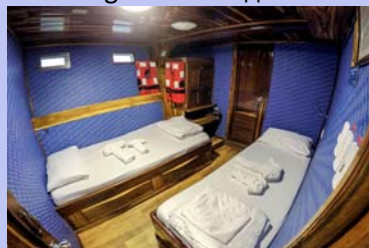
MY Fragata Twin – Lower Deck