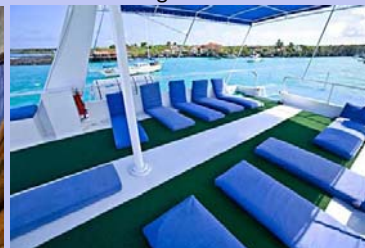
MY Fragata - Relax on the sundeck

Food and drink: Breakfast is provided in Quito and all meals while on your cruise. MY Fragata has a fully stocked bar and bottled water is available throughout.