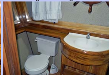
MY Fragata - Bathroom