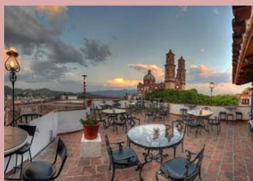
Hotel Terrace in Taxco