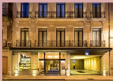
Colonial 4* Mexico City

Accommodation: If you are familiar with the Byroads style of touring you will know there is an emphasis on 'boutique' or character hotels. Mexico is such a place however in Cuba this isn't always easy. What you can be sure of is that hotels are always clean and comfortable and well located. Where character hotels are available we use them. In Cuba it's a mix of colonial hotels and we also use 'Casa Particulares' or bed & breakfasts in Camaguay and Trinidad which allows us a more authentic Cuban experience which we think you will love.