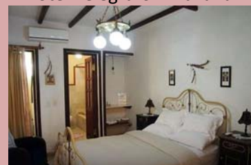
Room at a 'Casa Particular'

Food and drink: Breakfasts are included daily. Bottled water, soft drinks and alcohol are all readily available.