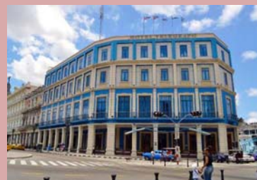
Hotel Telegrafo - Havana