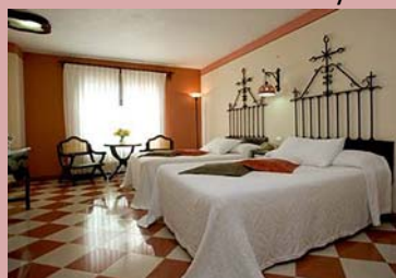
Comfortable Room in Merida