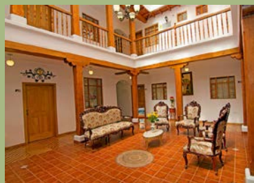
Comfort in Quito's historic centre