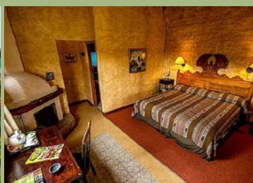
Charming rooms with character