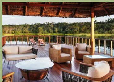
Ecuador's premier jungle lodge