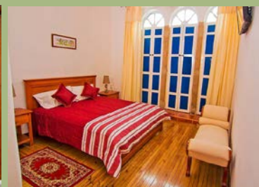
Stylish rooms with en-suite