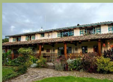
150 year old Hacienda in Otavalo

Accommodation: For your Ecuador Adventure we have selected some wonderful accommodation. On the outskirts of Otavalo you stay in a 300 year old hacienda whilst in the colonial heart of Quito you stay in an elegant boutique hotel. For your stay in the Amazon Jungle you stay at Sacha Lodge, one of Ecuador's best wildlife lodges. Remote yet accessible, unspoiled yet comfortable, the eco-lodge is the perfect base for you to explore the fascinating Amazonian rainforest.