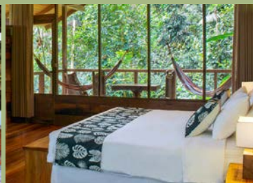
Absolute comfort in the jungle

Food and drink: Breakfast is included each day. Elsewhere, you enjoy the great variety of local food on offer. At Sacha Lodge all meals are included. Beer, wine, spirits, soft drinks, tea, coffee and bottled water is widely available at extra cost.