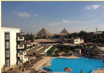
Stay right by the Pyramids in Cairo

Accommodation: Our accommodation has been carefully selected and it's one of the many highlights of our tour. In Cairo our 4-star hotel is located close to the Great Pyramids while our deluxe cruise boat offers fantastic Nile river views from every cabin. The boat's restaurant serves both Egyptian and international cuisine and there is a lounge bar with dance floor and music. The sundeck offers a pool as well as sun loungers and a shaded area. In Aswan we have chosen a small Nubian style hotel and in Alexandria we have chosen a colonial style hotel located on the Mediterranean corniche.