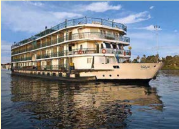
Luxury on the Nile