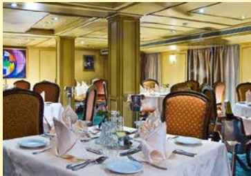
Sumptuous Meals On-Board