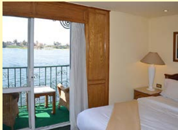
Double Cabin with Nile Views