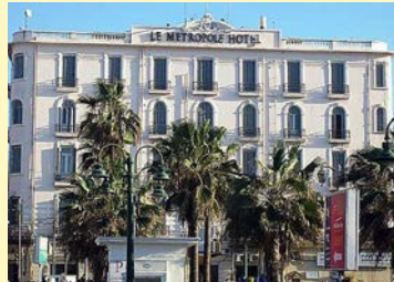
Comfort by the Mediterranean

Food and Drink: Breakfast is included every day and all meals are included while on cruise. Elsewhere, we enjoy the great variety of local food on offer. Soft drinks are widely available and alcohol can sometimes be hard to find.