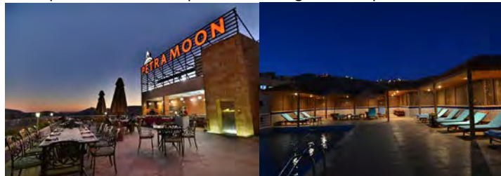
Comfort & Charm at the gates of ancient Petra

Food and drink: Breakfast is provided each day, along with 1 lunch and 1 dinner. Beer, wine & spirits are available at selected locations whilst soft drinks, juices and bottled water are available throughout.