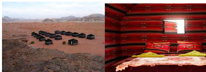
Atmospheric Bedouin Camp in the stunning desert landscape of Wadi Rum