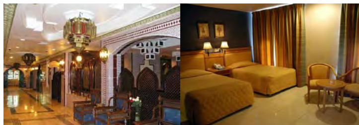
Eco Friendly 3+ Star, Amman

Accommodation: Hotels in Jordan tend to be quite new and modern in their design with few boutique style hotels available. What you can be assured of is that they will be clean, comfortable and well run. In Amman we stay in an atmospheric 3+ star hotel with an arabic feel while on the Red Sea at Aqaba our hotel is a modern classic style. Our comfortable Bedouin Camp in Wadi Rum is set amongst stunning desert scenery and is an unforgettable experience. During our stay in Petra our top rating hotel is located just 100m from the entrance to the Heritage site. It's renowned for its friendly staff and excellent service.