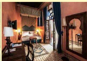
Stunning Riad hotel, Fes