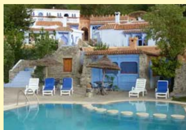
Village hotel, Chefchaouen

Accommodation: Our accommodation has been carefully selected and it's a highlight of our tour. In Fes and Marrakech we stay in traditional Riads, now converted into boutique hotels. In Chefchaouen we stay in a lovely village hotel. In N'kob we stay in an authentic Kasbah, and our two-night stay at Ait Benhaddou is always a huge hit. In Essaouira we stay in a boutique hotel just a few minutes walk from the main square. Some of our hotels have pools and all exude charm and character.