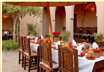
Authentic Kasbah, N'Kob