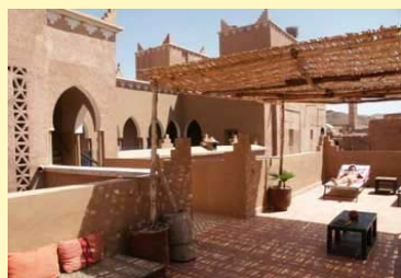
Boutique Kasbah, Ait Benhaddou