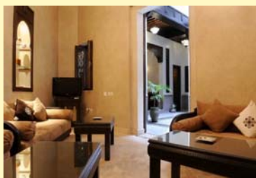
Boutique Riad, Marrakech

Food and drink: Breakfast is included every day and some other meals are included where there are no other options. Elsewhere, we enjoy the great variety of local food on offer. Soft drinks are widely available, but alcohol can sometimes be hard to find – particularly away from the major cities.