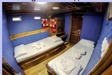
MY Fragata Twin – Lower Deck