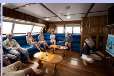
MY Fragata – Lounge Room