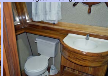
MY Fragata - Bathroom