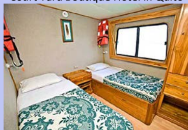
MY Fragata Twin - Upper Deck