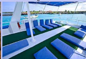
MY Fragata - Relax on the sundeck

Food and drink: Breakfast is provided in Quito and all meals while on your cruise. MY Fragata has a fully stocked bar and bottled water is available throughout.