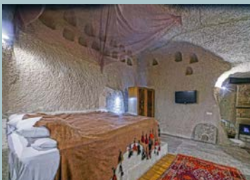
Cave Suite, Goreme

Food and drink: Breakfast is included every day. For most lunches and dinners you are free to enjoy the great variety of tasty and inexpensive food. Bottled water can be found everywhere and the normal range of soft drinks is available, along with beer and a good selection of Turkish wines.