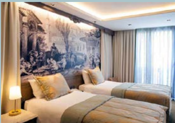
Luxurious Comfort in Istanbul

Accommodation: The accommodation is a particular highlight of this trip and each property has been carefully selected. In Istanbul we stay in a very well located boutique hotel just minutes from the Blue Mosque. In Sirince we overnight in a charming village house and in Safranbolu we experience a typical Ottoman style hotel in the centre of town. At Amasya we relax at a boutique spa hotel and in Goreme we stay in an atmospheric cave-style hotel, with great views of the village.