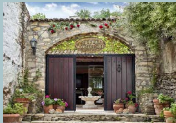
Sirince Village Boutique Hotel