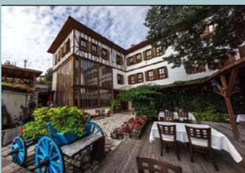
Ottoman Style, Safranbolu