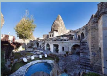
Cave Hotel, Goreme