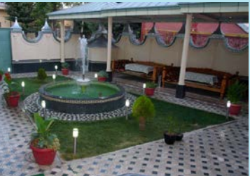
Courtyard coffee shop in Samarkand

Food and drink: Breakfast is included every day. Elsewhere, we enjoy the great variety of local food on offer. Beer, wine, vodka, soft drinks, tea, coffee and bottled water is all widely available.