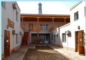
The best location in Khiva