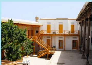
Bukhara courtyard hotel