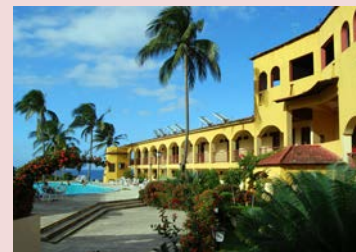
El Castillo Hotel - Baracoa

Food and drink: Breakfasts are included daily. There is not a lot of variety in Cuban cuisine. Meals are generally simply prepared and wholesome. Seafood is particularly good value. Bottled water, soft drinks and alcohol are all readily available.