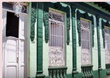
Entry to a 'Casa Particulares'