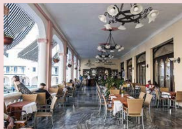
Casa Grande - Santiago de Cuba