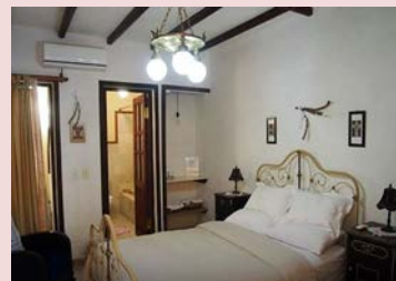
Typical Room of a 'Casa Particulares'