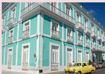
Hotel La Reunion - Cienfuegos