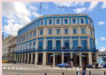
Hotel Telegrafo - Havana

Accommodation: If you are familiar with the Byroads style of touring you will know there is often an emphasis on 'boutique' or character hotels. In Cuba this isn't always easy, but our preference is for small hotels, in good locations. In Havana we stay in a colonial hotel close to historical 'Old Havana' and likewise in Santiago de Cuba. In Trinidad and Camaguey we stay in Cuba's popular 'Casa Particulares' or bed & breakfasts which allows us a more authentic Cuban experience which we think you will love.