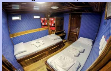
MY Fragata Twin – Lower Deck