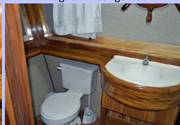
MY Fragata - Bathroom