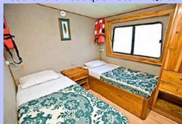
MY Fragata Twin - Upper Deck