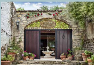
Sirince Village Boutique Hotel