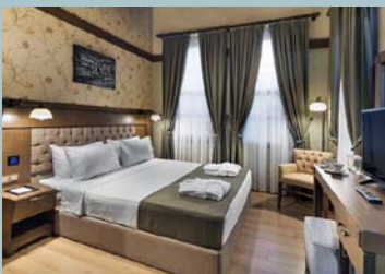
Boutique & Spa Hotel Amasya