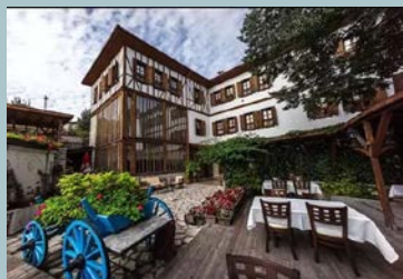
Ottoman Style, Safranbolu