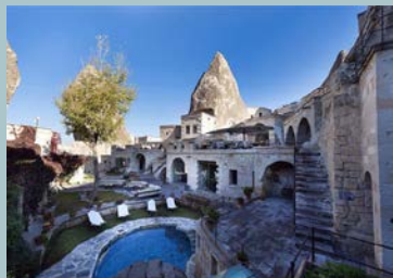
Cave Hotel, Goreme