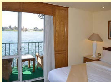
Double Cabin with Nile Views