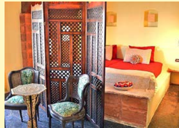
Traditional Nubian style in Aswan