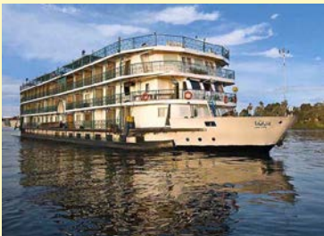
Luxury on the Nile