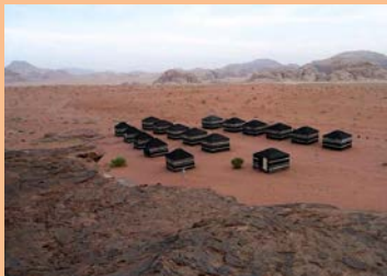
Luxury Bedouin Camp, Wadi Rum