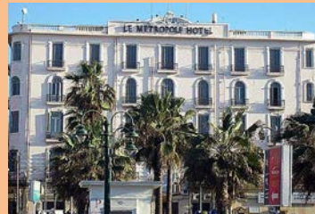
Comfort by the Mediterranean

Food and drink: Breakfast is provided daily and all meals while on Nile Cruise. Beer, wine & spirits are available at selected locations whilst soft drinks, juices and bottled water are available throughout.