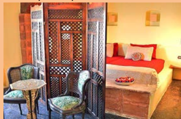
Traditional Nubian style in Aswan