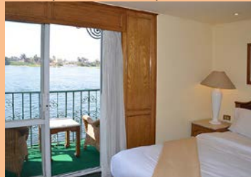
Nile Cruise with River Views