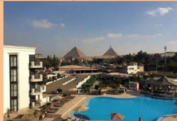
By the Pyramids in Cairo