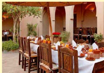
Authentic Kasbah, N'Kob