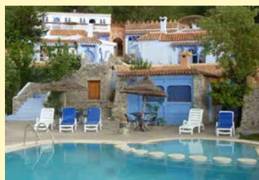
Village hotel, Chefchaouen

Accommodation: Our accommodation has been carefully selected and it's a highlight of our tour. In Fes and Marrakech we stay in traditional Riads, now converted into boutique hotels. In Chefchaouen we stay in a lovely village hotel. In N'kob we stay in an authentic Kasbah, and our two-night stay at Ait Benhaddou is always a huge hit. In Essaouira we stay in a boutique hotel just a few minutes walk from the main square. Some of our hotels have pools and all exude charm and character.