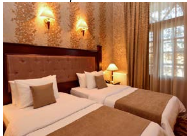
4 Star comfort by the river in Tbilisi