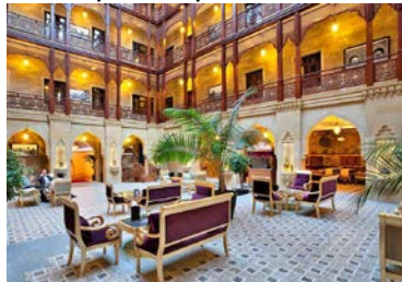
Traditional style in historic Baku

Accommodation: On this tour we offer an interesting selection of hotels ranging from the traditional to the modern. Boutique hotels with sufficient rooms for a small group are hard to find but we are sure you will not be disappointed. In Baku our hotel is located in the heart of the old walled city and offers wonderful Azerbaijani elegance. In Sheki we stay in an 18 th Century caravanserai. It's basic with private facilities and it's wonderful. Our hotel in Tbilisi is modern and comfortable and well located. In the mountains in Gudauri we overnight in a mountain chalet and in Yerevan we stay in a stylish comfort in the heart of the city.