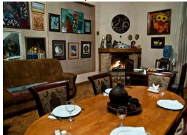
Mountain Retreat in Dilijan