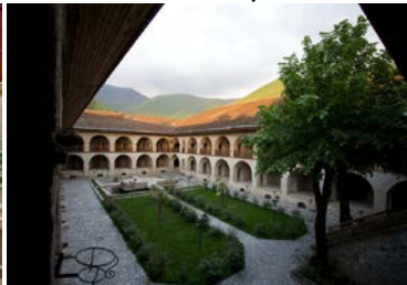
2 Star Caravansari in Sheki