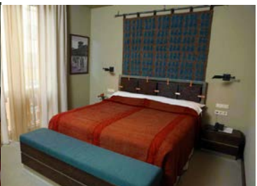
Stylish 5 Star in the heart of Yerevan

Food and drink: Breakfast is provided each day, along with 2 lunches and 3 dinners. Beer, wine & spirits are available at selected locations in Azerbaijan and throughout Georgia and Armenia. Soft drinks, and bottled water are readily available.