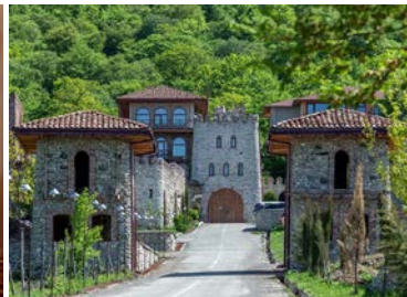
Chateau in Telavi