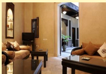
Boutique Riad, Marrakech

Food and drink: Breakfast is included every day and some other meals are included where there are no other options. Elsewhere, we enjoy the great variety of local food on offer. Soft drinks are widely available, but alcohol can sometimes be hard to find – particularly away from the major cities.