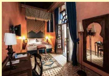
Stunning Riad hotel, Fes