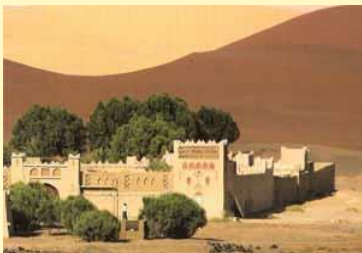
Desert hotel in the Sahara