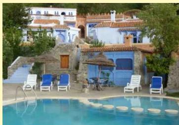
Village hotel, Chefchaouen

Accommodation: Our accommodation has been carefully selected and it's a highlight of our tour. In Fes and Marrakech, we stay in traditional Riads, now converted into boutique hotels. In Chefchaouen we stay in a lovely village hotel. In N'kob we stay in an authentic Kasbah, and our two-night stay near Ait Benhaddou is always a huge hit. In Essaouira we stay in a boutique hotel just a few minutes' walk from the main square. Some of our hotels have pools and all exude charm and character.